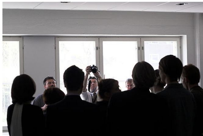
Photographer at work at UIAH Media Lab graduation ceremony. This one is mine...

This adds up to a social dynamic that encourages creativity and individuality rather than conformity and uniformity. If there is a "bland trap" at Flickr, it's much less insidious and the forces pushing you into it are much weaker, and there's a really good chance of getting into a virtuous circle where you do your stuff and get the feedback and encouragement you need in order to continue doing it your way. That's why Flickr is better for you than photoSIG.