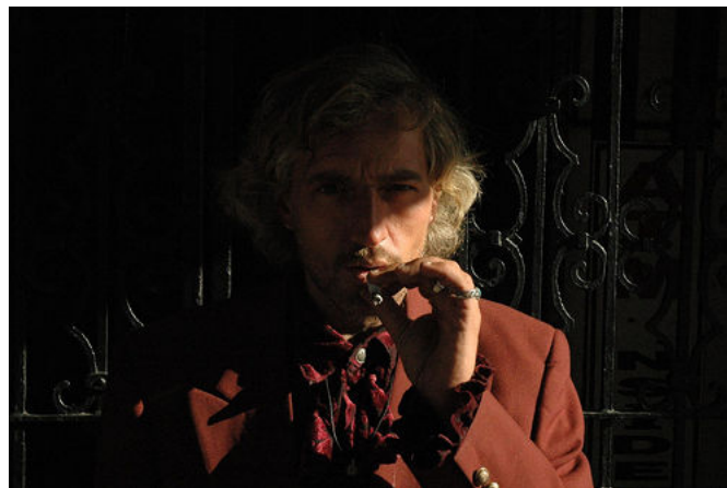
Photo by Stephen Schwartz [ http://www.flickr.com/photos/vasculata/ ] -- the fellow who pulled me into Flickr. This is one of my favorites in his "Smokers" series. Some rights reserved. [ http://creativecommons.org/licenses/by-nc-nd/2.0/ ]

The upshot of this is that the minute you set yourself up at Flickr, defining yourself with some of these tags, even before you've uploaded a single photo, you're invisibly linked to a network of like-minded people: simply use the search tools to find people whose tags match your own.